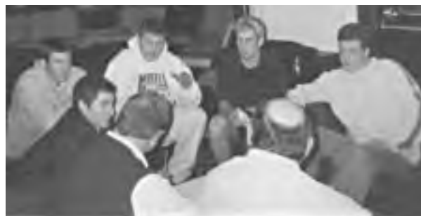
Feasibility study with Holt Engineering.

Adding a ladies' room on the first floor is also a priority. Most of the other ideas concerned heating, windows, lighting, power outlets, telephone and computer lines, door locks, trash handling, and a long list of cosmetic concerns. We look forward to seeing the recommendations of the study and working actively with alumni toward their implementation.