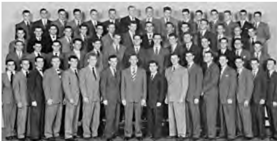
DU in 1951.