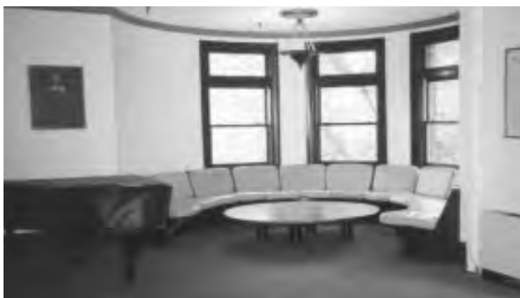
Above, left: New windows in the circular room. Above, right: New windows in the chapter room. Both rooms were painted, and ceiling tiles in the chapter room were replaced.