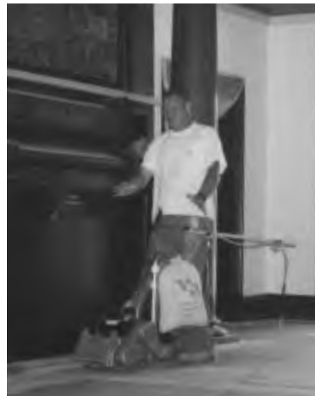
Above: The great hall floor in process. Right: Sanding the floor.