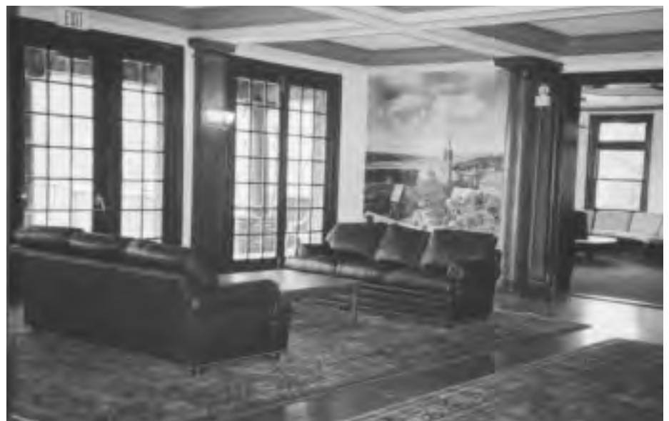
The great hall after renovations.

"This ambitious effort was developed by the alumni directors with the belief and confidence that our 850 alumni brothers were prepared to support a plan that would restore the chapter to its original condition..."