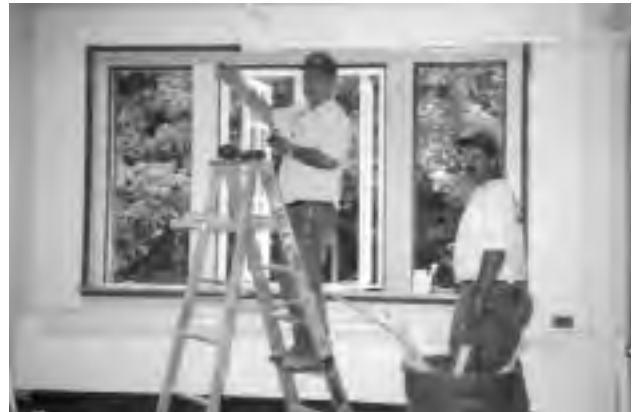
New windows in a study room.