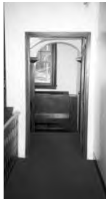
Above, left: Staircase between first and second floors, in process. Center: Staircase from second to third floor, with new carpeting and paint. Right: Second-floor landing with new bench.