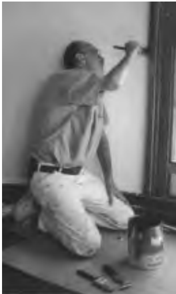
Above: Window woodwork painting in the tower room.