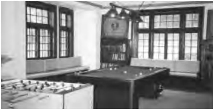
The library was painted, bookcases and benches were repaired, and some new windows were installed.