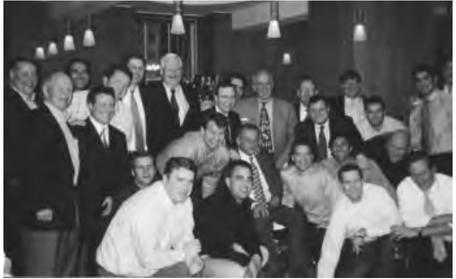
The assembled crowd finds a photo op.