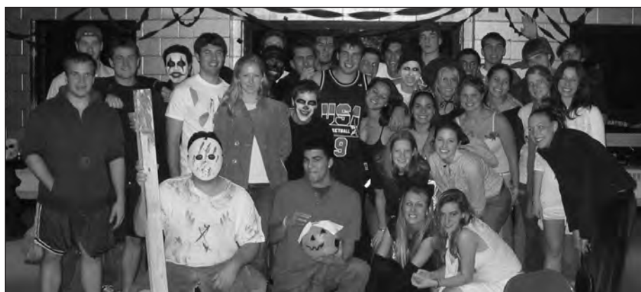
DU brothers and sisters of Kappa Alpha Theta during DU's haunted house.