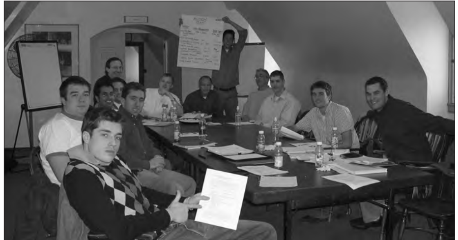
Alumni and undergraduate officers gather for the February retreat.