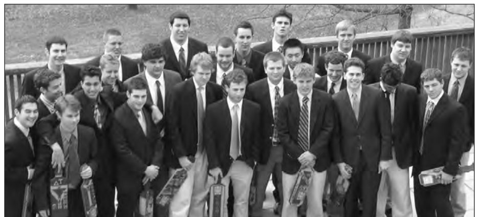
Twenty-six new DU brothers on the porch after initiation