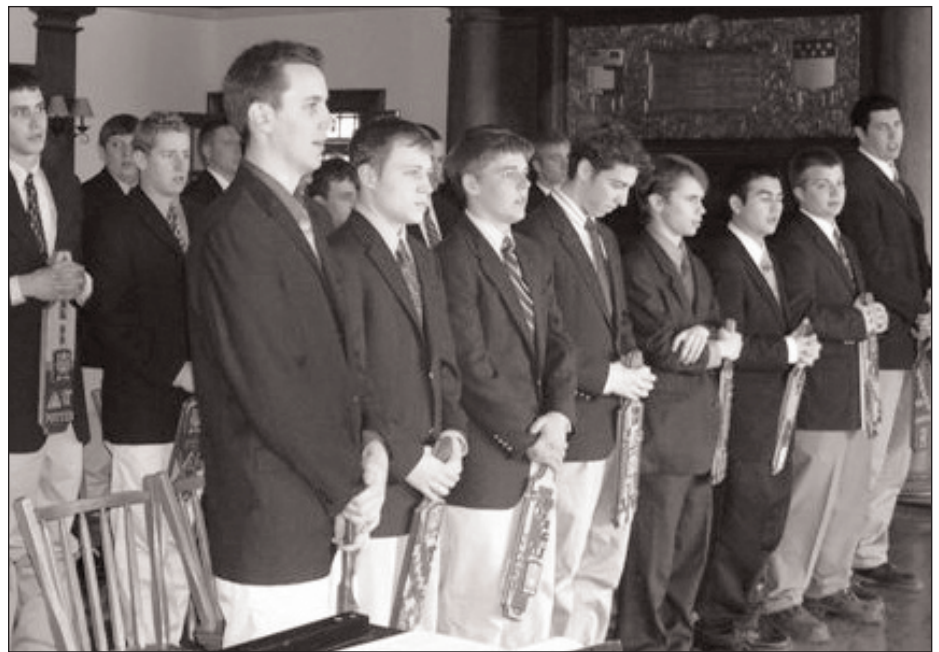
DU's newest members at their initiation.