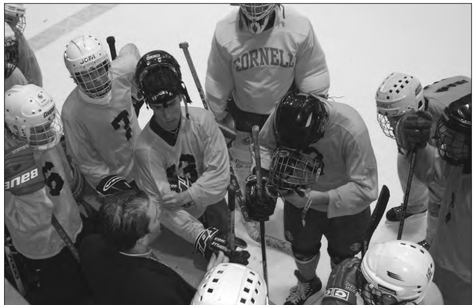
The brothers gather for a meeting on the ice during DU intramural hockey.