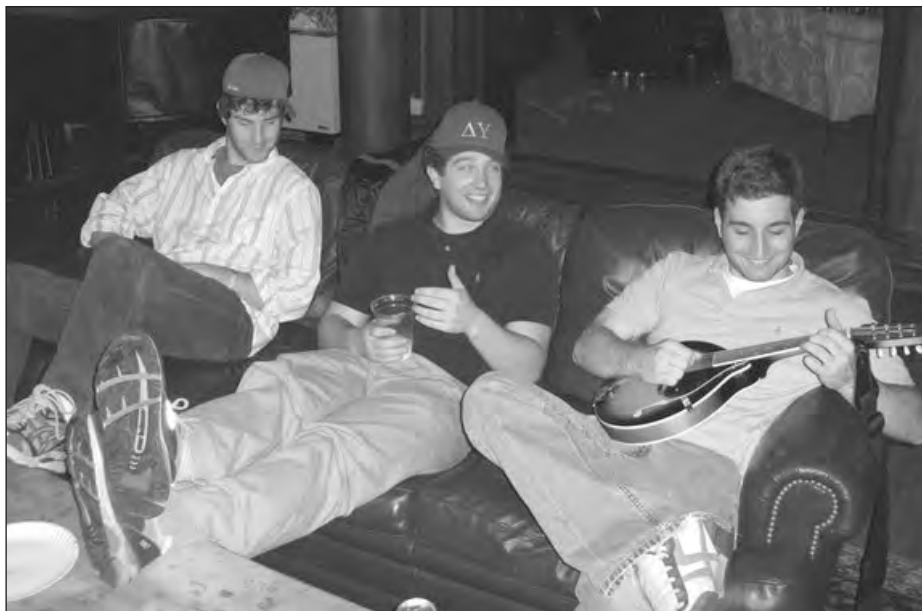
Brothers relax at the chapter house.

Perhaps the most important task facing the member education program in the future is the search for a chapter faculty advisor. Several candidates have been considered for the position, and the chapter hopes to finalize its choice and secure an advisor by the fall.