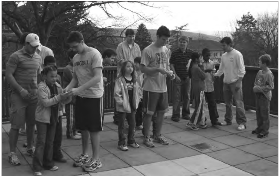
The annual DU Easter Egg Hunt.

The biggest philanthropic event of the semester was the annual Easter Egg Hunt, in which the entire brotherhood participated. Done in coordination with the Ithaca Youth Bureau, over 30 children invaded the chapter house one Saturday afternoon and participated in a variety of events—like egg painting, relay races, and, of course, a hunt for eggs and candy. The brotherhood hid candy and over 200 eggs throughout the chapter house, and the kids found everything, having a great time in the