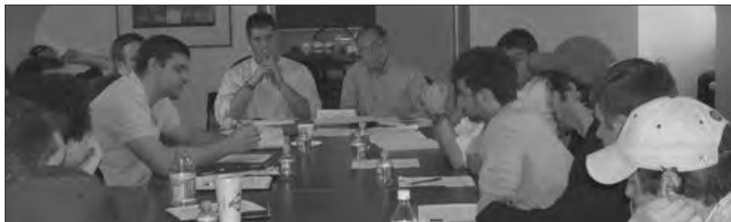
The DU executive board meets for a retreat in February. (See related story, page six.)