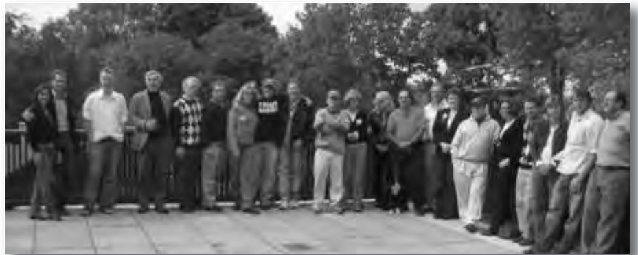
Undergraduate brothers pose with their families during Parents Weekend.

Sunday morning was the parent-son golf tournament, which featured six teams. The tournament ended after 11