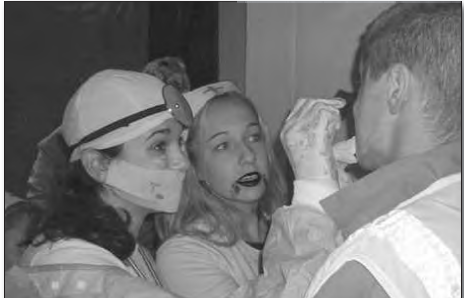
Scenes from DU's haunted house fundraiser.