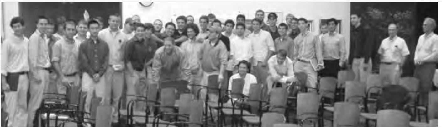
A scene from the chapter retreat, held at the Lab of Ornithology in September.

At the end of the day, we recapped the session and actions we would take as the results of our valuable discussions. Best of all, we left the session relaxed, refreshed, and ready to face another year of student life, classes, philanthropy events, parties, memories, and brotherhood.