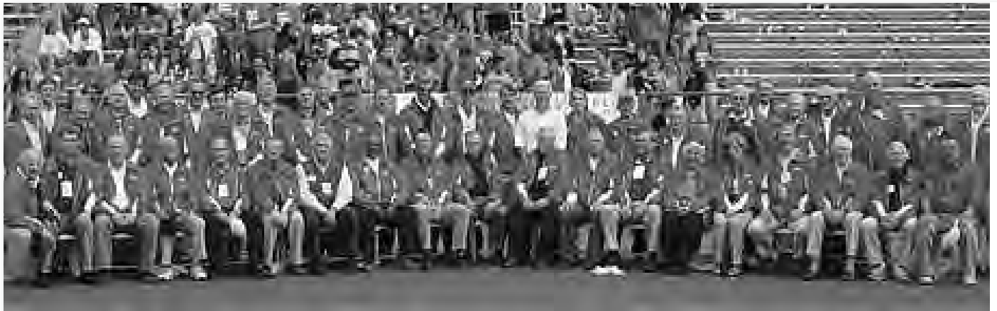
Brothers and friends gather for a group photo on the field.