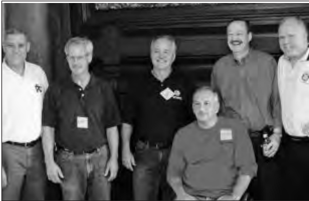
Class of 1973.