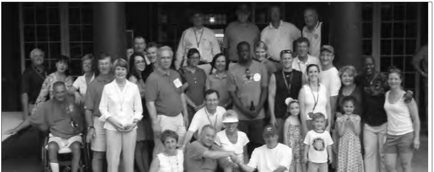
Brothers and friends gather for a photo during Reunion.