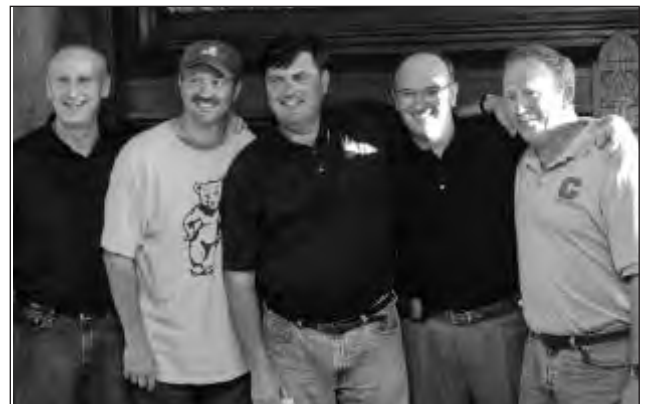
Class of 1979.