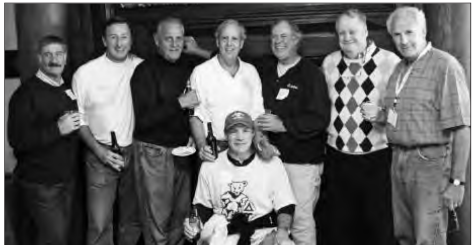
Class of 1970.