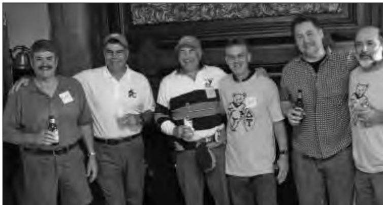
Class of 1975.