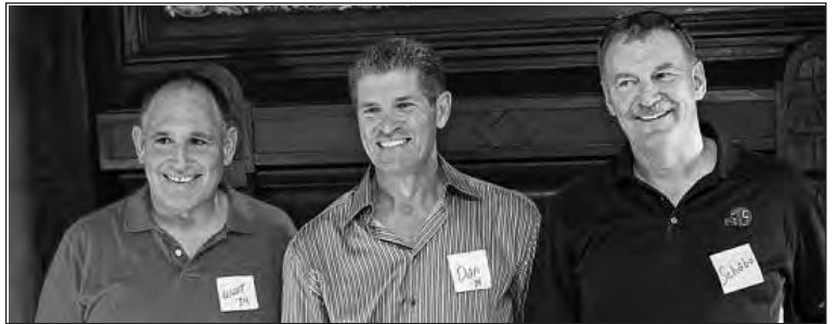
Class of 1974.