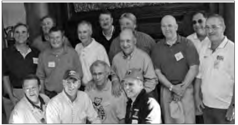
Class of 1972.