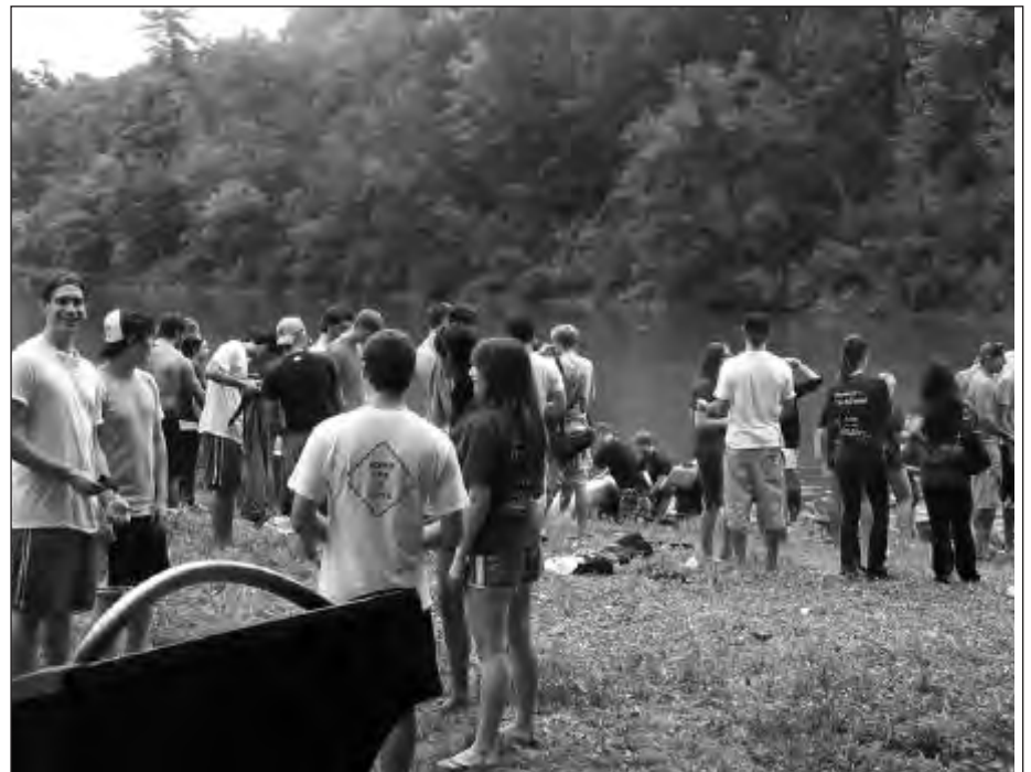
Brothers on the shores of Beebe Lake at the Tip-A-Canoe philanthropy.

The Fraternity and Sorority Advisory Council Annual Report listed