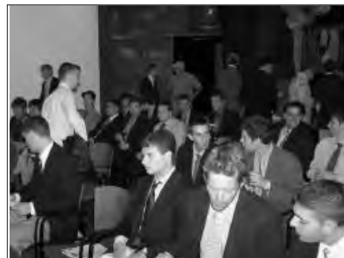
Undergraduate brothers gather at a DU retreat.

We can build from these successes in many ways: Surpassing Homecoming 2008's success in 2009 is an obvious objective. Events at other times of the year and in other cities can enable even more brothers to reunite and build relationships. (Who among you is interested in leading such an effort in Pittsburgh, Chicago, New