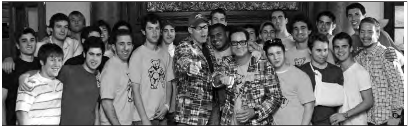
Current undergraduates with a few 1980s brothers.