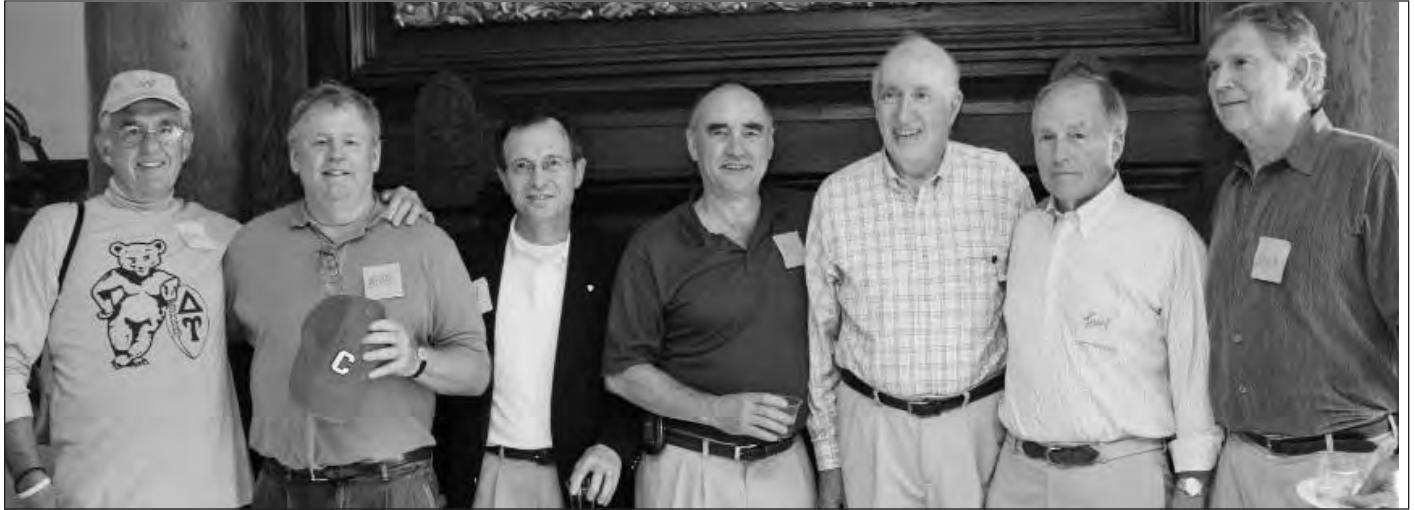
Classes of the '50s and '60s.