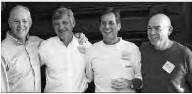
Class of 1971.