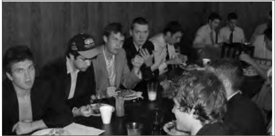
DU brothers enjoying dinner before a chapter meeting.

Attendance at brotherhood events, philanthropy fundraisers, cleanups,