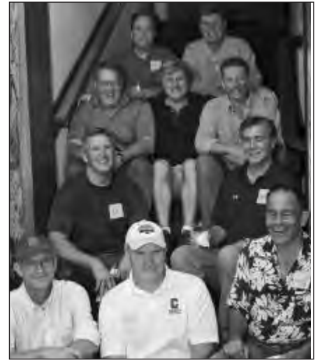
Class of 1978.