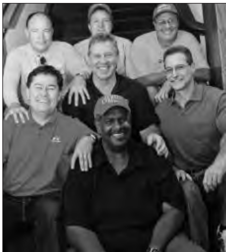
Class of 1976.