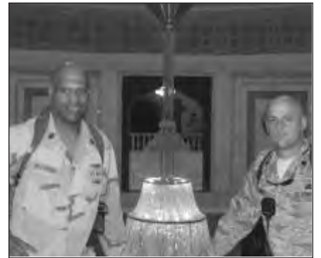
Lamb '91 and Baltimore '90 in Iraq.