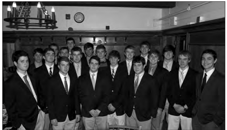
19 members of the new 2011 pledge class attending their first chapter meeting. (The other six were out of town.)