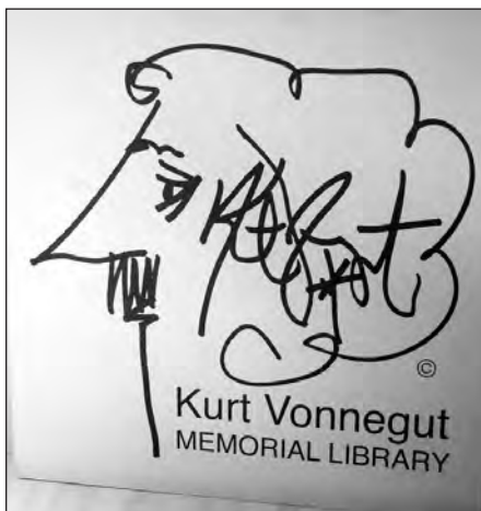
Kurt's self-caricature signature.