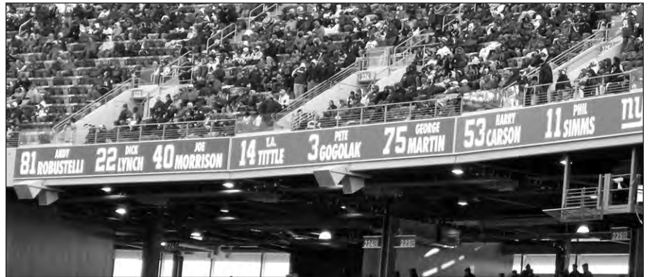
A magnificent honor for Peter Gogolak!