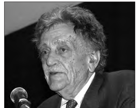
Kurt speaking at the Cornell Daily Sun.

Kurt Vonnegut: 1922–2007 ... "So it goes!" Visit www.vonnegutlibrary.org .