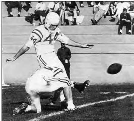
Kevin Bruns '79 purchased this photo from the Cornell library in 1976.