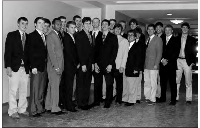
The 2010 pledge class.

Schools: ALS (7), ILR (4), Arts & Sciences (3), Engineering (3), Communications (2), Economics (2), Hotel (2), Archaeology, Human Ecology. States: New York (14), California (3), Connecticut, Georgia, Hawaii, Massachusetts, Ohio, Oregon, Pennsylvania, Virginia.