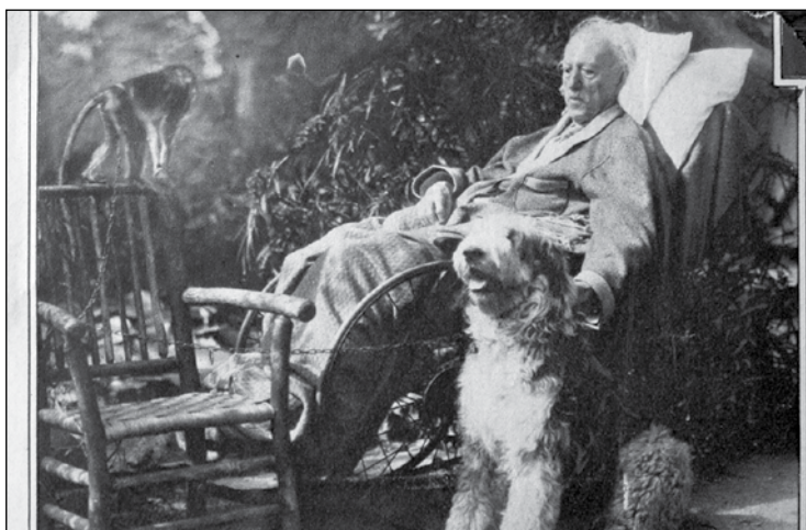
David Starr Jordan, class of 1872, was the first president of Stanford University. Leland Stanford visited Indiana University, where Jordan was president, and personally offered him the position.