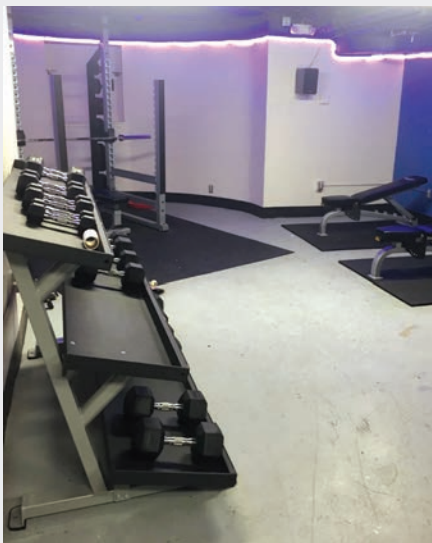
Barbells, benches and lifting rack.

As Cornell announced plans for a largely virtual and heavily isolated semester, the young men of 6 South Avenue (excited nonetheless) geared up for an uncertain living experience at Delta Upsilon fraternity. Executive officers developed a comprehensive move-in and daily operations plan that enabled brothers to move to Ithaca safely and to then enjoy an as-normal-as-possible fraternity experience. Physically, the chapter house has undergone significant changes to accommodate tight COVID-19 restrictions. The capacities of first floor common spaces have been cut by 75%. Brothers are strongly encouraged to wear masks in the facility at all times. The back deck has added dining spaces